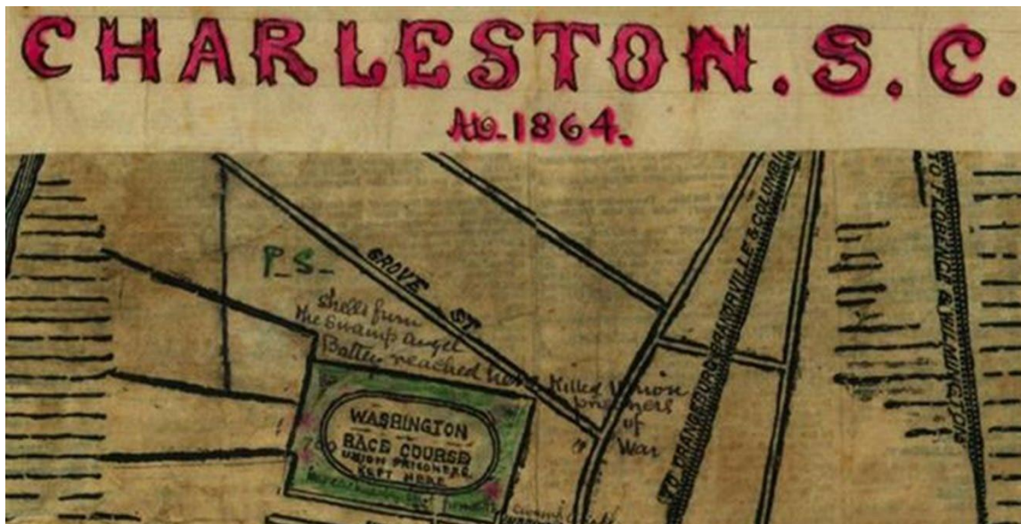
{Union POWs were held on the race course grounds; hundreds died from disease.}

In April, 1865, twenty-eight black workmen went to the site, re-buried the Union dead properly, and built a high fence around the cemetery. They whitewashed the fence and built an archway over an entrance on which they inscribed the words, " Martyrs of the Race Course ." 10,000 freed slaves and U.S. Colored Troops paraded and decorated the new graves with flowers, May 1, 1865.