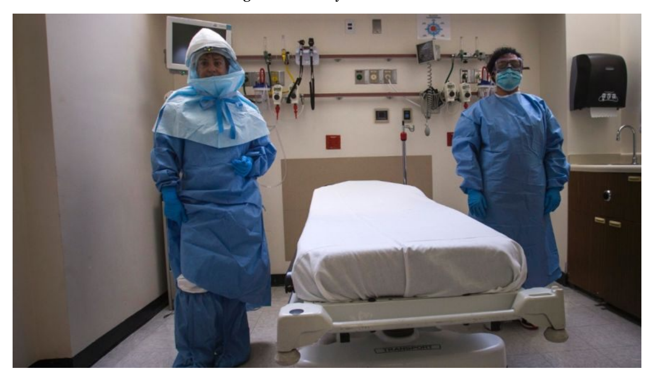
{The new normal. I'm sure they're still smiling.}

The paradigm shift that we're experiencing in biosafety awareness is phenomenal. Of course, the phenomenon is the pandemic. It has taken millions of infections and hundreds of thousands of deaths to awaken our understanding that biosafety matters.